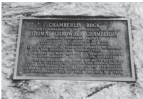
Figure 9. Chamberlin Rock on the University of Wisconsin–Madison campus, commemorating Chamberlin's service to Wisconsin as state geologist and president of the university.

geology department at Madison. When the rumor spread that Salisbury might be leaving Beloit, a petition urging him to stay was circulated and signed by nearly every student at the college. Saul was so touched by this expression of student support that he declined the offer. However, when the offer was renewed the following year, he resigned his position at Beloit to join his former mentor at Madison and once again Rollin Salisbury—a lifelong bachelor—became a member of the Chamberlin household.