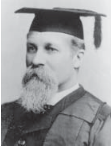
Figure 1. Thomas Crowder Chamberlin, 1843–1928. Photograph taken in 1892.