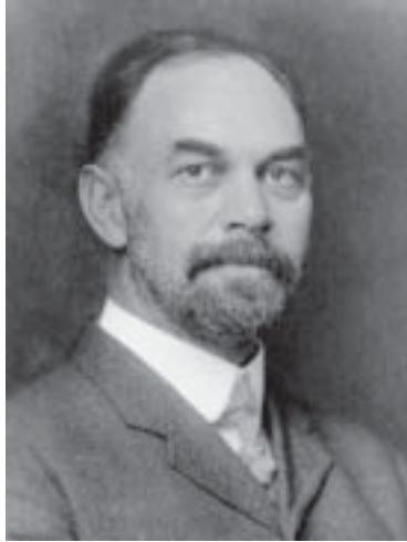
Figure 2. Rollin Daniel Salisbury, 1857–1922. Photograph taken about 1910.