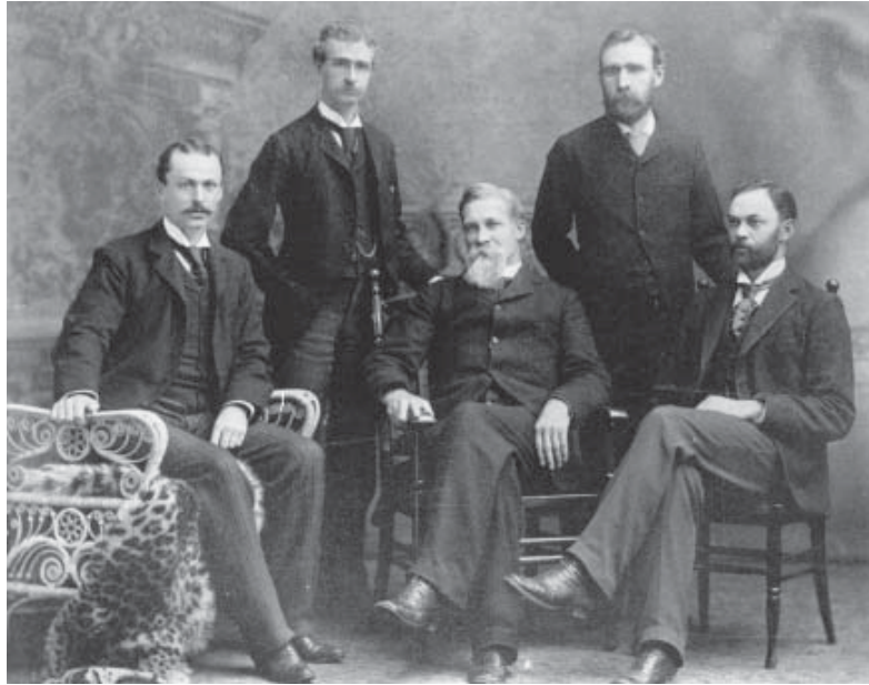
Figure 10. Original Chamberlin geology department faculty at the University of Chicago, 1892. From left to right: R.A.F. Penrose, Jr., J.P. Iddings, T.C. Chamberlin, C.R. Van Hise, and R.D. Salisbury.